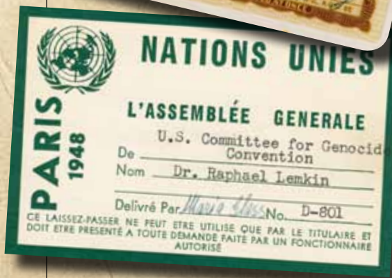
Raphael Lemkin's War Department and United Nations identification cards.

Raphael Lemkin Papers, American Jewish Historical Society, New York, NY