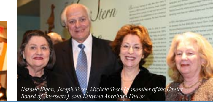
The Center for Jewish History Annual Dinner December 2006