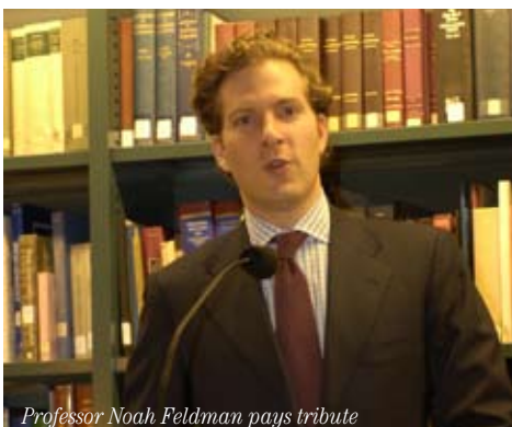
to the Center's library and its founder