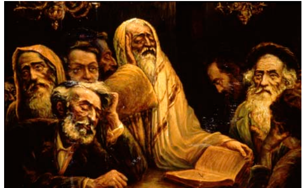
Yizkor (memorial for Theodor Herzl). Boris Schatz (1866-1932). Painting: oil on board.

To mark the first decade of CJH and Partner achievements at this location, a new exhibition planned for October 2010 will gather an outstanding collection of artifacts, documents, photographs, paintings, three-dimensional objects, and books that relate to the first decades of new centuries. Objects to be presented will reveal the historical impact and experiences of 1910, 1810, 1710 and other critical decades, providing a window into changing technology, political activity and those elements of Jewish heritage that have remained constant as well as those that have evolved over time. The specialist fields of the Partners will provide access to distinct and diverse communities while simultaneously demonstrating shared traditions.