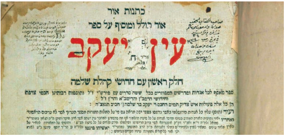
Compilation of Talmudic stories, Slavuta, Ukraine, 1816