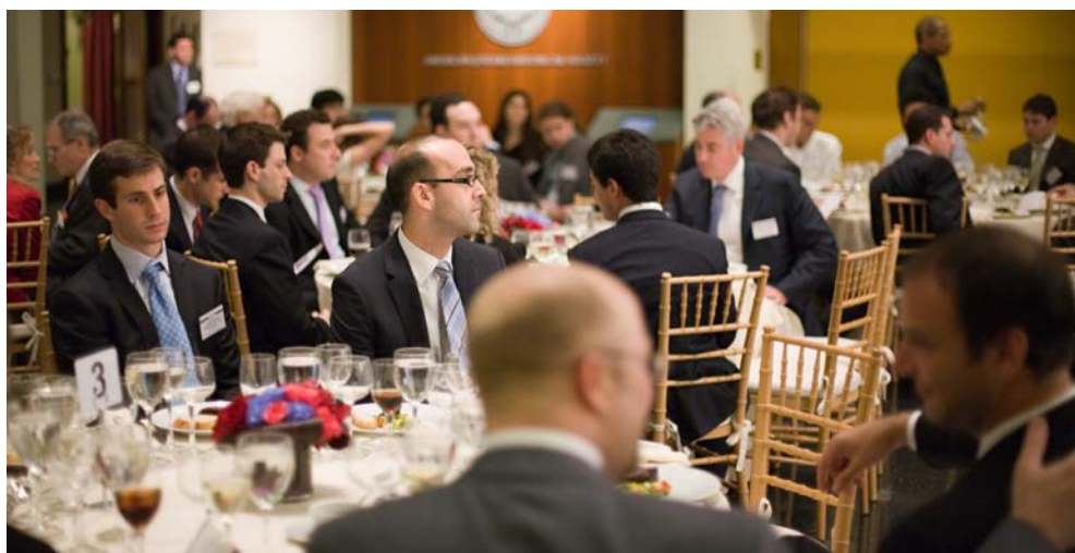
Guests enjoying dinner in the Paul S. and Sylvia Steinberg Great Hall at the Legacy Council Launch

In honor of the Center's 10th anniversary, a major exhibition and several events are planned.