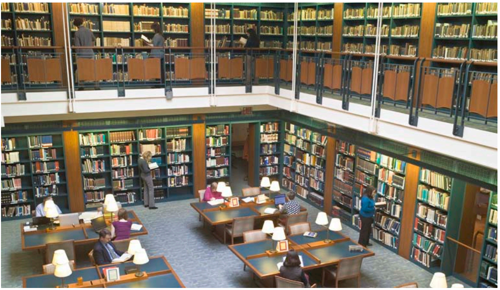
The Lillian Goldman Reading Room