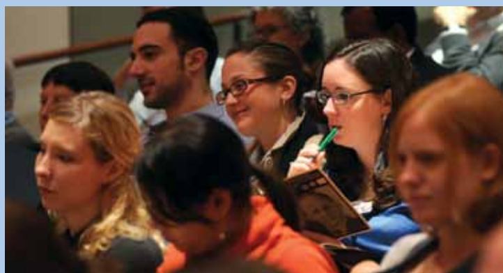
Audience captivated by conference presenters