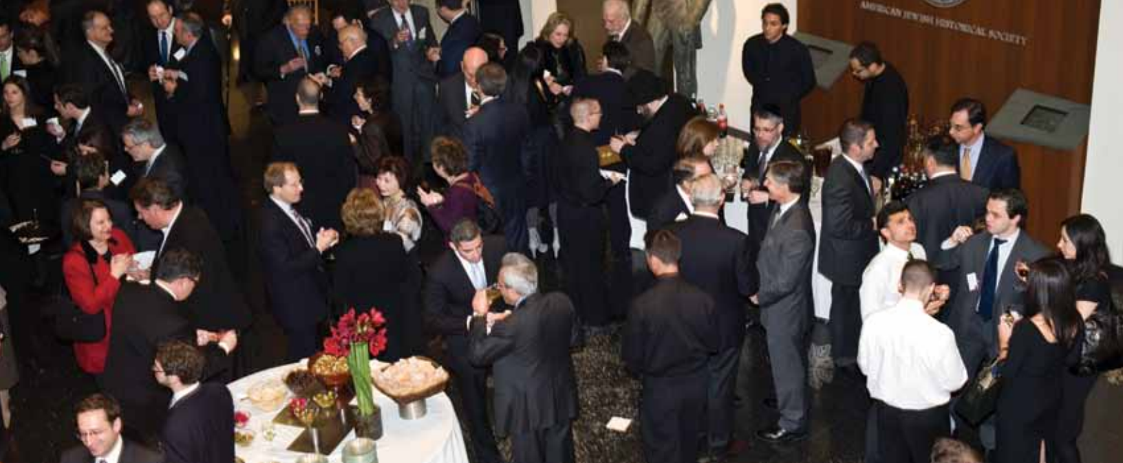
Guests mingle during cocktails at the Center's Great Real Estate Families of Gotham.