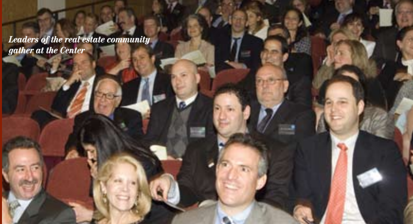
Leaders of the real estate community gather at the Center